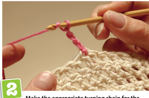
Make the appropriate turning chain for the first new stitch.