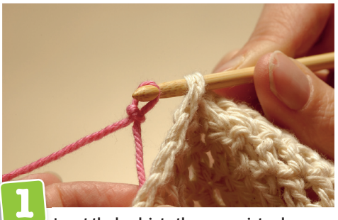
Insert the hook into the appropriate place. Start with a slip knot or a simple loop and then pull this through.